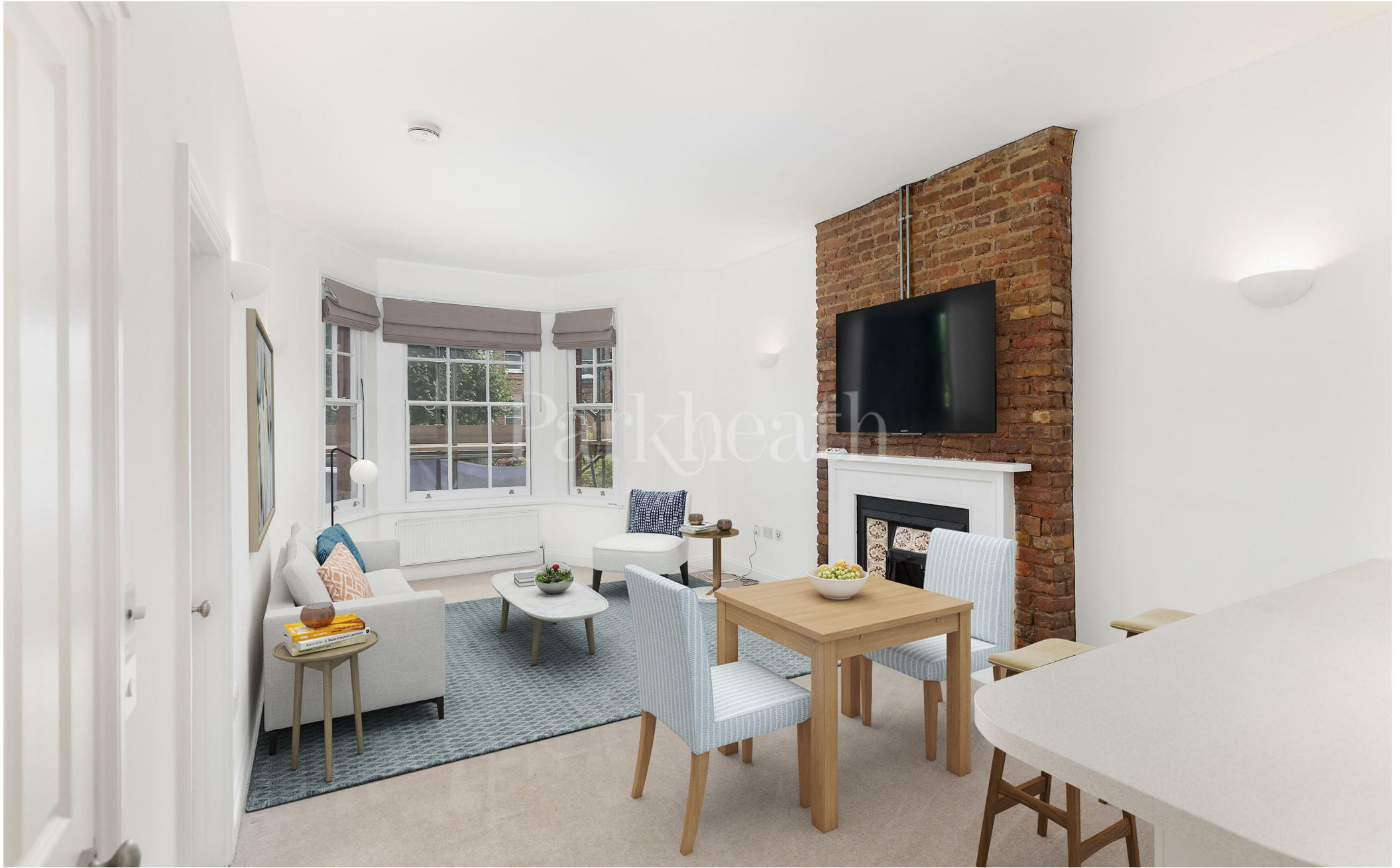
Goldhurst Terrace NW6